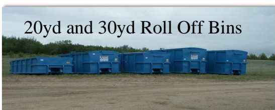
20yd and 30yd Roll Off Bins

**NEED ROLL OFF BIN SERVICE? Bin Services are ideal for: Renovations, Spring Clean-up, Roofing, Estate Clean-up, Yard Waste and almost anything else you can think of . . .